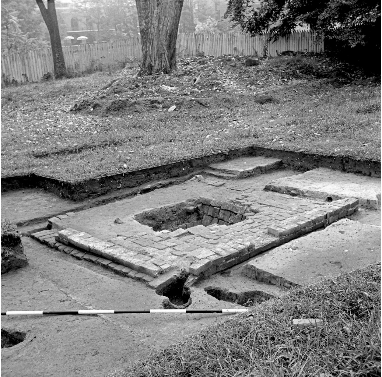
FIGURE 10. Foundations of what was thought to be a dairy outbuilding discovered south of the extant ca. 1810 kitchen. The central pit was lined with both bricks and tiles held together by yellow clay. Photo from the northwest. 64-INH-697

archaeological evidence showed that these two tasks had been performed on the building with the brick and tile-lined pit (Harwood 1779:26). Therefore, unless these two identical repairs were made on more than one structure, it can be almost sure that the building refurbished by Harwood was the one south of the kitchen and that it served as a dairy by 1779. Even though the central pit was not the typical type found in 18th-century dairies, it probably was utilized in some way to help with the cooling of the structure. It should also be mentioned that on the same day that Harwood charged McClurg for flooring and underpinning the dairy, he noted that he was due