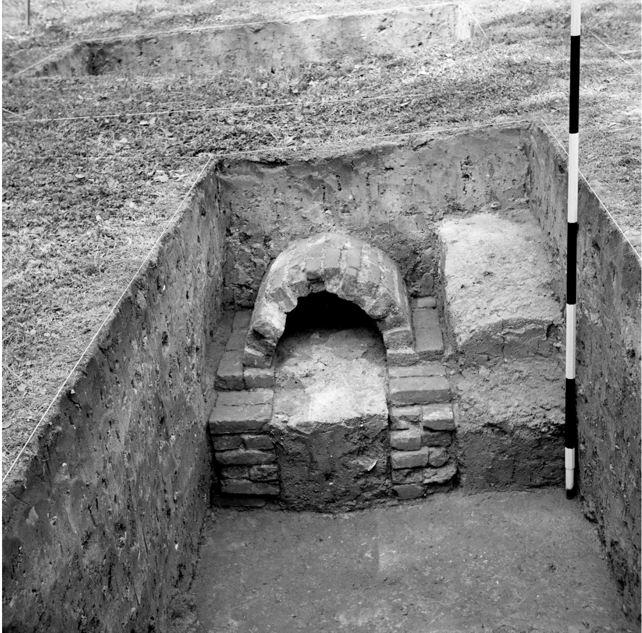
FIGURE 6. Close-up view of the brick drainage tunnel prior to removing its fill. Photo from the south. 64-INH-597

Both the Custis and “Corotoman” tunnels possessed square manholes (Figure 7) which were, no doubt, installed to facilitate easier cleaning of the drain. The “Corotoman” manhole was positioned some 37 ft. from the house whereas the Custis one was placed 59 ft. from the dwelling. All that can be deduced from these facts is that the openings were probably situated at arbitrary distances from the mouth of the tunnel rather than at a prescribed interval. The Custis manhole, with an opening which measured 2 ft. square, had been filled with great quantities of domestic rubbish (E.R. 797D). The debris, deposited in the period ca. 1770 – 1785, included fragments of creamware saucers, tureens, plates, and bowls along with a plate base of overglazed