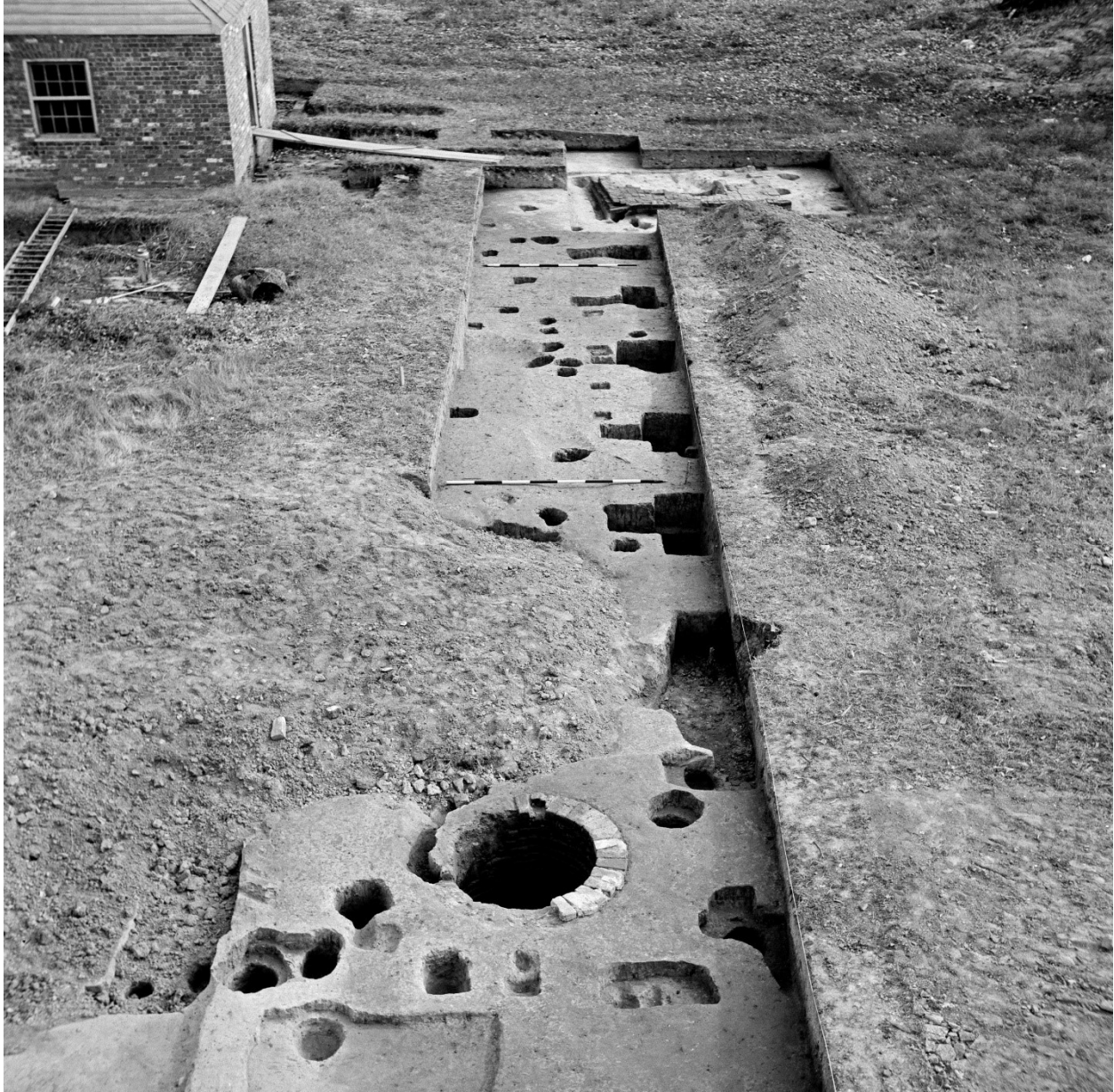
FIGURE 14. Aerial view of the elaborate series of holes discovered between the well complex and the dairy (?) outbuilding. Well B can be seen in the center foreground while the building in the left background is the extant ca. 1810 kitchen. Photo from the west. 64-INH-74

The digging southwest of the dairy (?) outbuilding produced what seemed to have been a stretch of colonial roadway. It was built of rammed brick rubble with an average width of 8 ft. and was pursuing a north/south course. However, since the feature was not followed to its northern limit, any change in the route was left undetected. The fact that evidence of the road was not found west of the dairy (?) would strongly suggest that it had either stopped or turned prior to entering the site's work area, but substantiation or rejection of the theory must be delayed until further archaeological investigations can be undertaken.