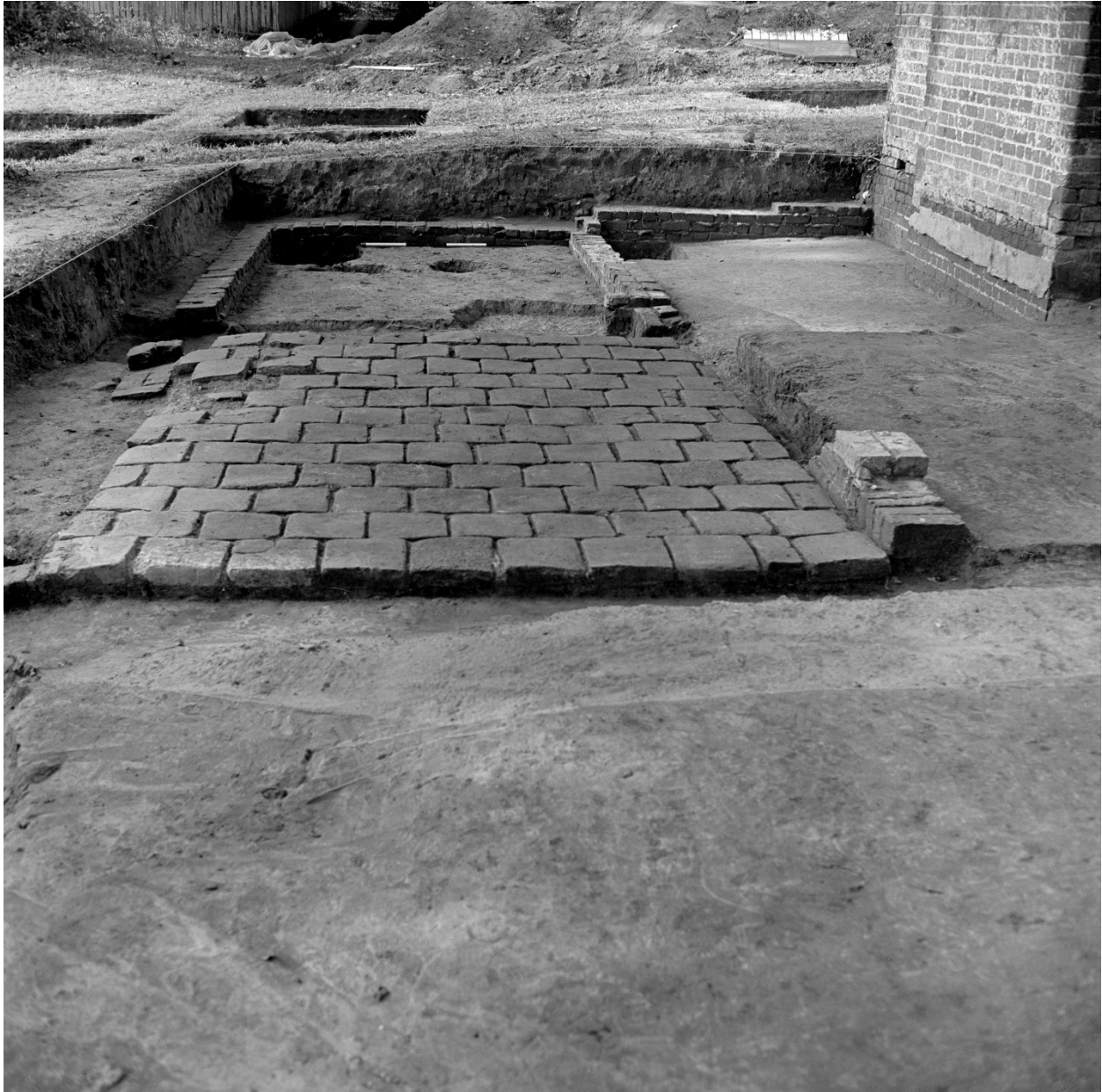
FIGURE 8. Structural remains of the colonial kitchen. The tile floor in the foreground had been installed in the northeast room. Beyond the paving was a narrow passage way which divided the northeast and southeast rooms. The larger west room was partially covered by the extant ca. 1810 kitchen (right background). Photo from the north. 68-PH-2291

mounds of wood ashes were deposited on the floor and these mixed with brown loam and mortar pieces to form a sealing stratum over the clay floor. This occupation layer (E.R. 806H) contained material which dated post ca. 1740.