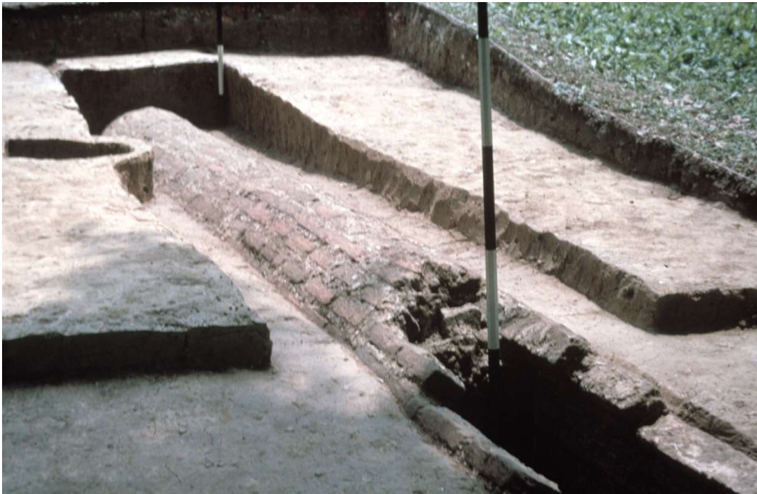
FIGURE 5. Partially excavated drainage tunnel which had extended northward from the dwelling's northeast corner. Photo from the south. 64-INH-615