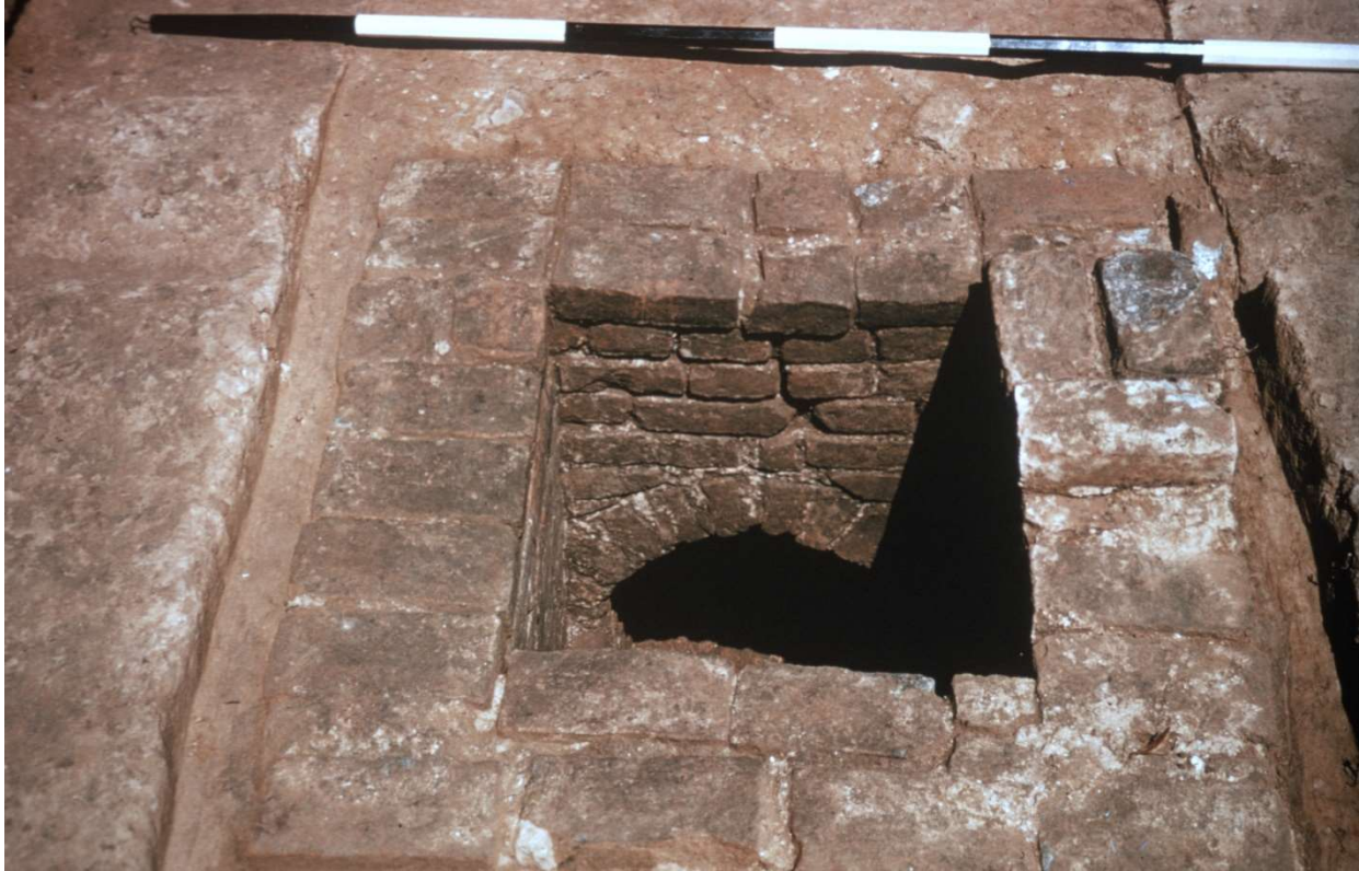
FIGURE 7. Custis tunnel's manhole after its filling had been removed. Photo from the south. 64-INH-623

Chinese porcelain and a teapot lid and two sauce boats made of white salt glaze. The architectural material recovered from the manhole fill included pieces of crown window glass, flooring tiles, and black slate—the latter possibly coming from mantles or from flooring of elaborate character. It should be noted that since these artifacts were deposited at such a late date they have no bearing on the life of the property in the John Custis period. The curious aspect of the tunnel's fill is that it indicated that the drain was abandoned prior to the destruction of the house—a fact which casts a shadow over the previously stated conclusions and conjectures as to the tunnel's utilization since the need for the drainage would not have been less great at the turn of the century than at the time of the facility's construction.