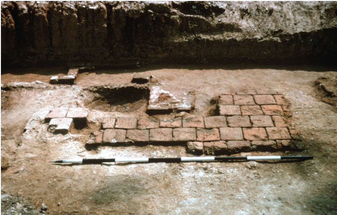
FIGURE 3. Flooring tiles unearthed in the western portion of the Custis dwelling's cellar. The remains of the south cheek of a chimney can be seen in the center and the some of the surviving west wall of the structure is at the right background. Photo from the east. 64-INH-634