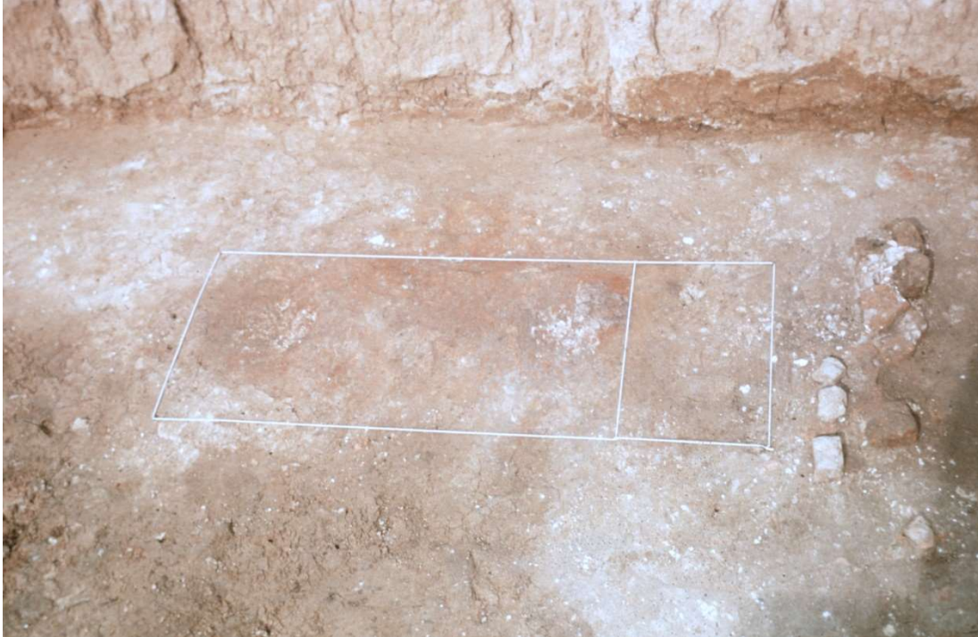
FIGURE 4. Robbed basement floor with string enclosed area indicating the area of burned clay whose discovery suggested the location of an east wall fireplace. Main building's surviving east wall can be seen in the left background. Photo from the north. 64-INH-628