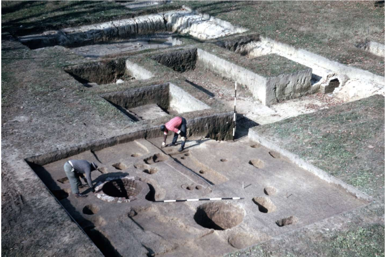
FIGURE 1. The Custis property's well complex and eastern part of the dwelling in course of excavation. The broken south end of the main house's drainage tunnel can be seen at right background. Photo from the southeast. 64-INH-732