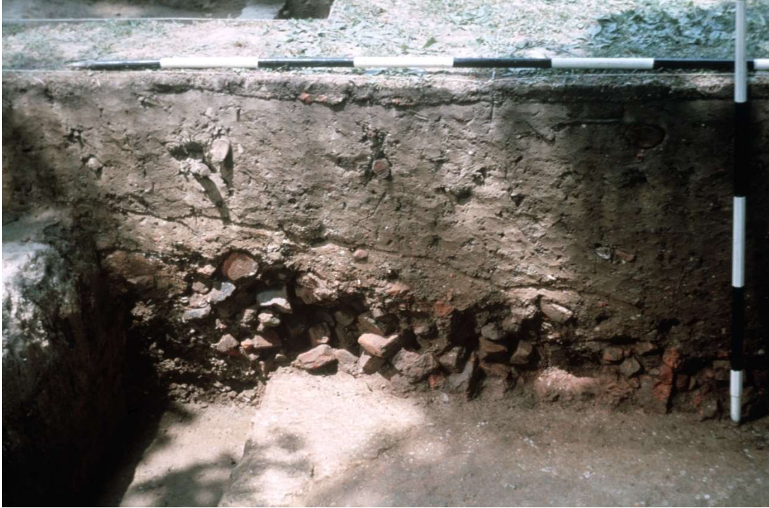
FIGURE 2. Detail of the Custis dwelling's cellar fill at left along with the debris in the structure's robbed south wall (right center). Photo from the west. 64-INH-609