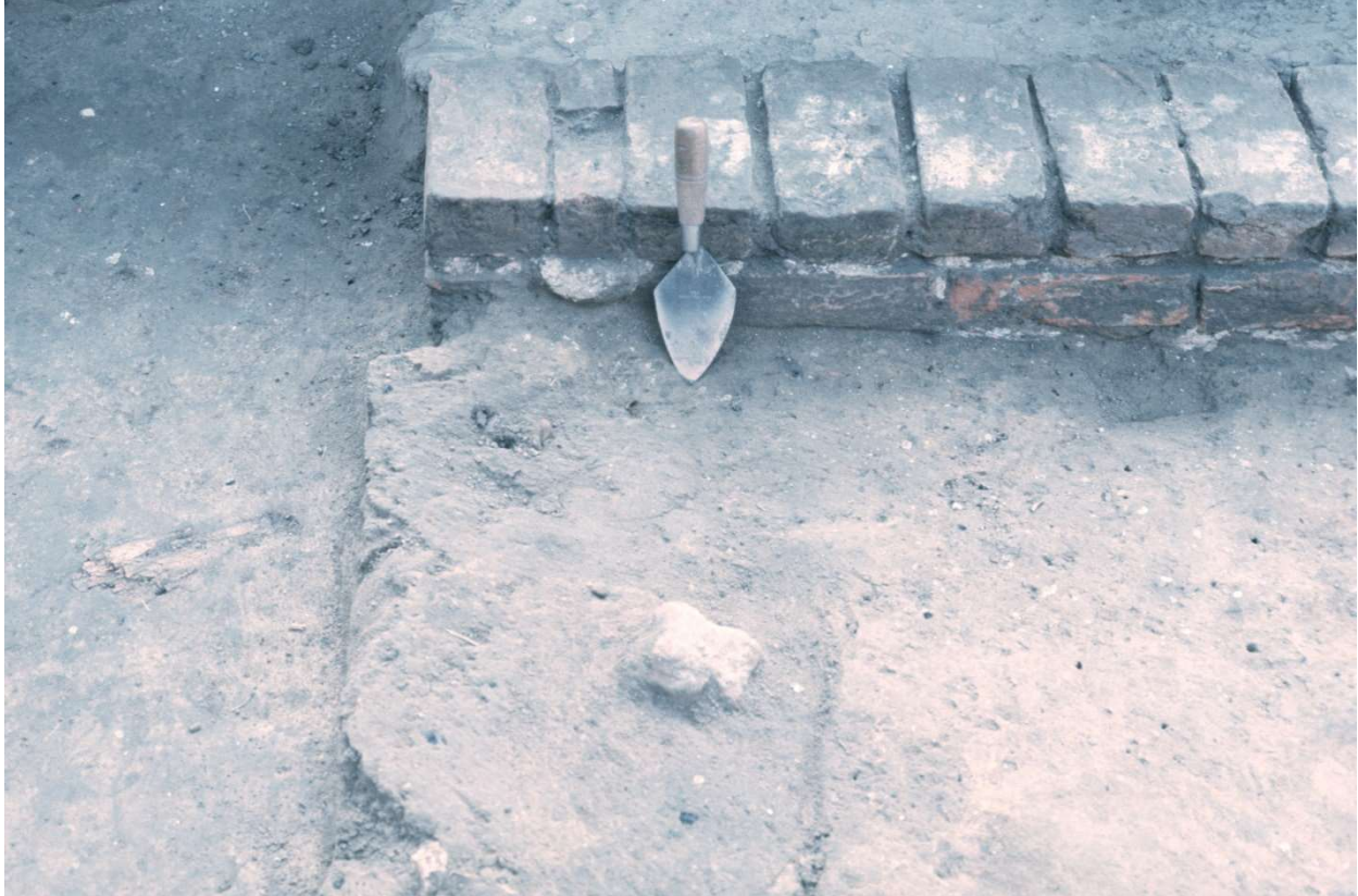
FIGURE 9. Surviving portion of a wooden sill found outside the kitchen's east wall. This evidence indicated the position of the structure's back door. The brickwork at top right is part of the building's east wall foundation. Photo from the north. 64-INH-676

main house. However, the brick tiles which survived in the kitchen's northeast room were laid on the dirty yellow clay without mortar. Perhaps, when the remainder of the west room is investigated, the purpose of the mortar will be determined conclusively.