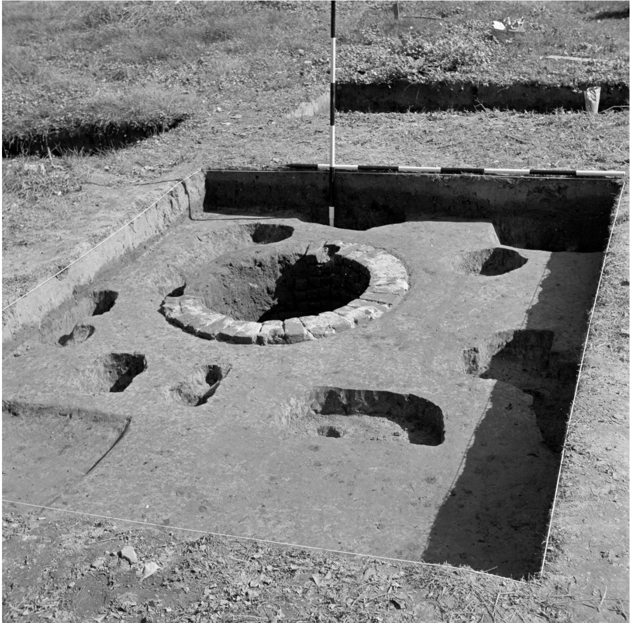
FIGURE 13. Well B after excavation. The post holes around the shaft indicated that a protective barrier had been installed while the water supply was being abandoned. Photo from the S.S.W. 64-INH-706