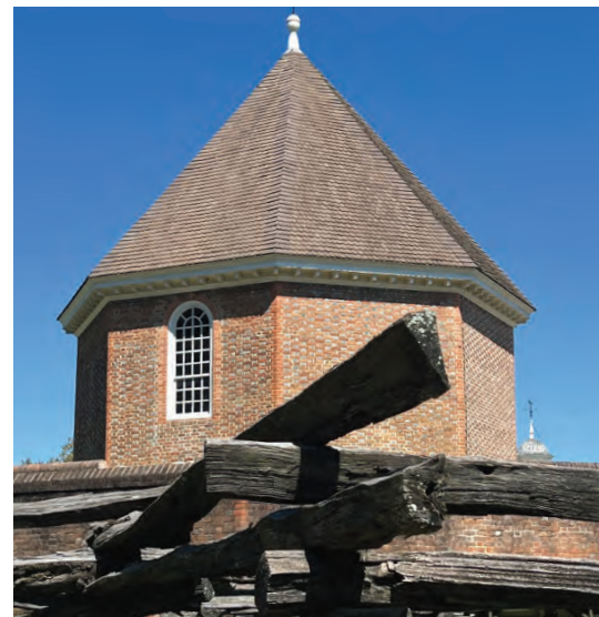
A carriage drives along Duke of Gloucester Street on a spring day. (Inset:) The Magazine, which was at the center of the Gunpowder Incident of 1775, is undergoing restoration that will more accurately represent its original design.